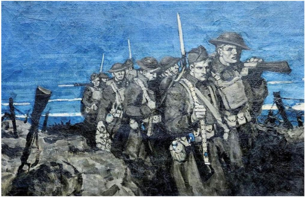
On 21 September 1917, 102 nd Machine Gun Battalion 26th Inf Div arrived at Saint-Nazaire, France.

P.S. Went to church yesterday but the y.m.c.a. secretary is a dead one. Haven't started smoking yet.